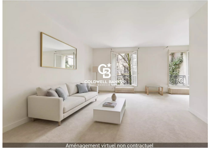
Aménagement virtuel non contractuel