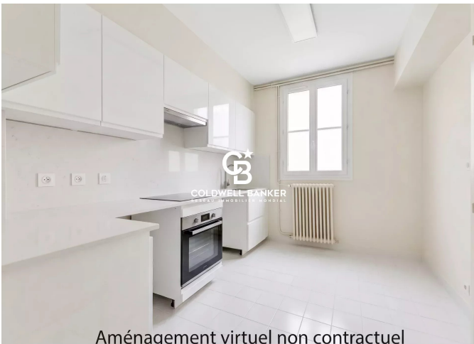
Aménagement virtuel non contractuel